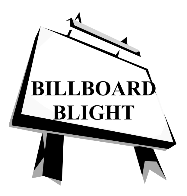
New Ordinance Coming By Dennis Hathaway

Anyone with an interest in local affairs knows by now, the city's six-year old ban on new billboards and its attempt to get thousands of illegal billboards removed have been abject failures. The visual landscape of the city is being treated more and more as a canvas to be filled with advertising, and billboards and other forms of signs put up without any permits or compliance with regulations continue to generate big profits for the outdoor advertising companies.