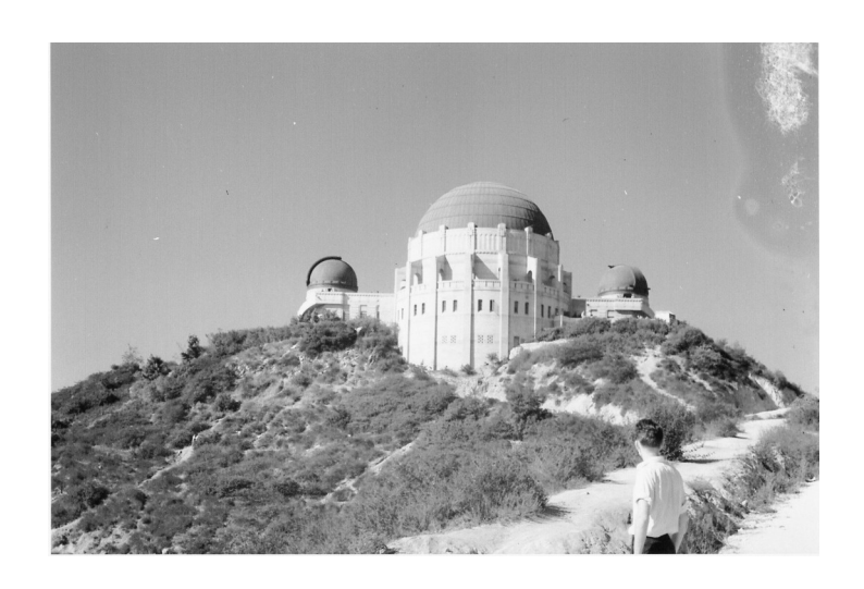
Griffith Park Observatory