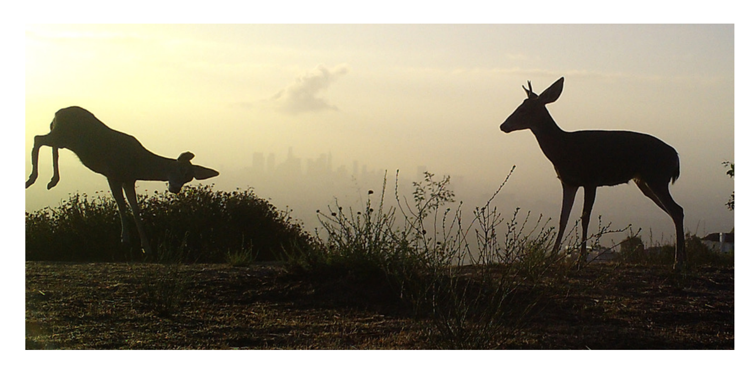
From Citizens for Los Angeles Wildlife December 14, 2021

Great news! Last week, LA City Councilmembers Paul Koretz and Nithya Raman co-introduced a motion to amend and provide better oversight of the program called "Own a Piece of LA." This will better protect habitat hubs and connectivity jeopardized by increased hillside development and fragmentation. You can read the city council motion <a href="here">here</a>.