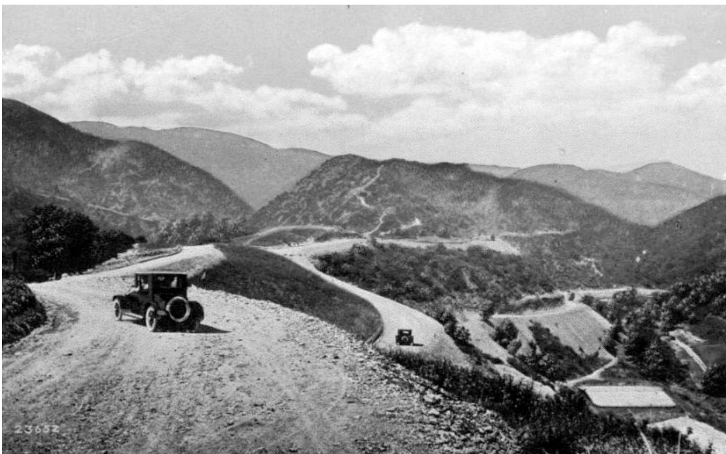
c. 1924 Two early model cars near the intersection of Mulholland Highway (later Drive) and Franklin Canyon.