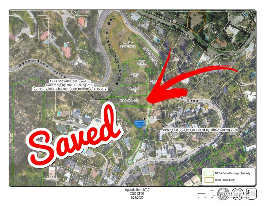
Fresh New Open Space at Laurel Canyon and Mulholland!

<u>Mountains Recreation and Conservation Authority</u> has come through yet again to preserve more land in Laurel Canyon.