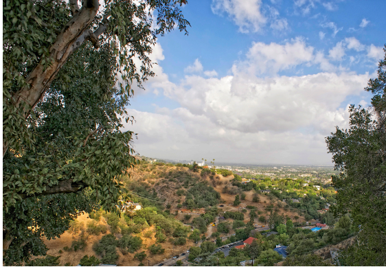
Open space preserved by Save Coldwater Canyon!

The Roman god Janus, for whom January is named, had two faces, one looking back, the other looking forward. Let us begin by looking back on 2018.