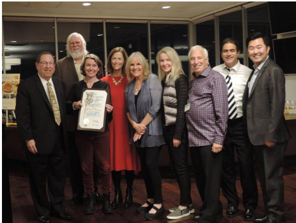
Honoring Save Coldwater Canyon!