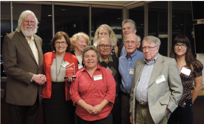
Honoring Friends of Griffith Park