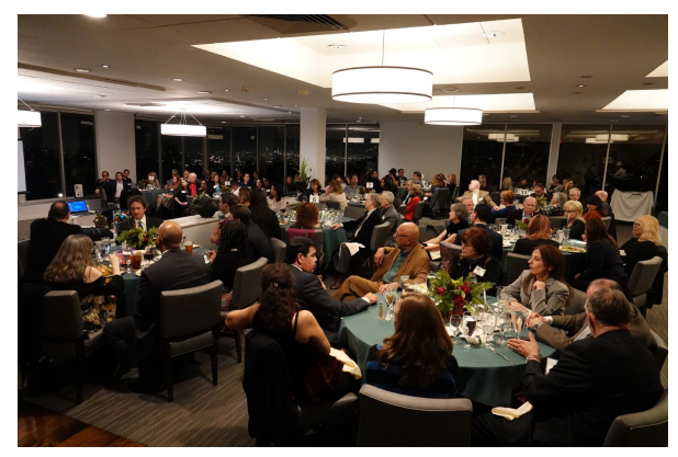
Federation members and guests enjoyed a wonderful buffet dinner and enjoyed the view from the Mulholland Tennis Club.