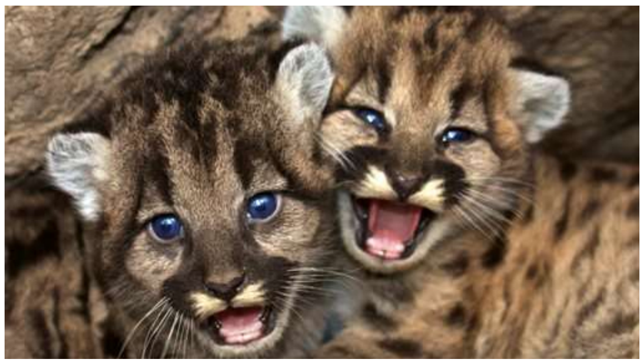
Recently discovered mountain lion kittens P-46 (female) and P-47 (male), National Park Service photo.