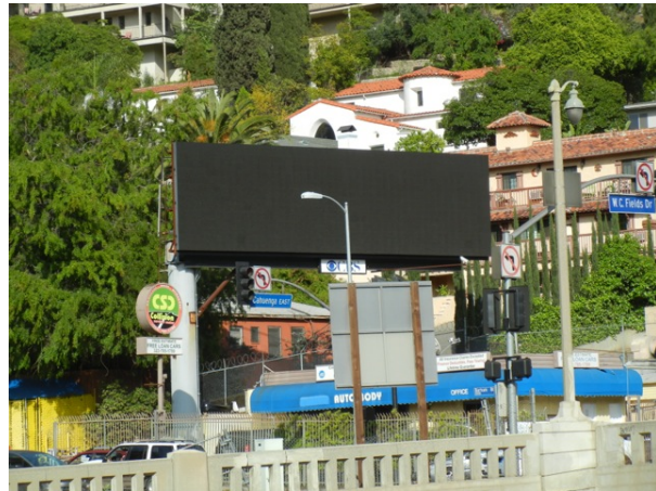
Cahuenga Pass billboard is dark.

Billboards are dark now, but will they stay dark?