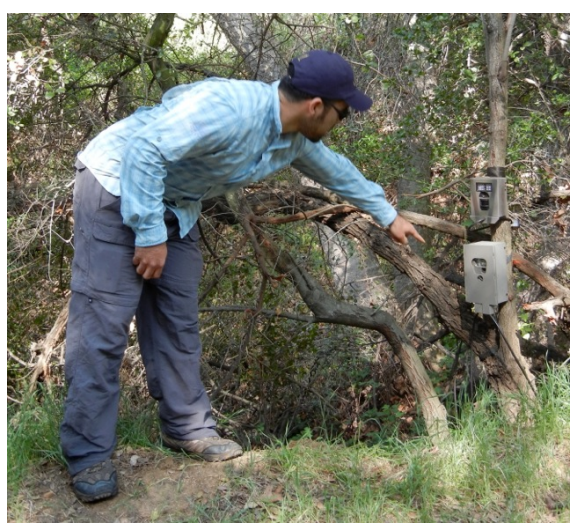
GPCS biologist checks a camera trap.

The motion-activated cameras are located at likely wildlife corridors along the edges of the park. After a particular area is well documented, they are moved to another location to expand the GPCS. If you see one of the cameras, please do not disturb it; it is an important tool in studying and protecting wildlife.