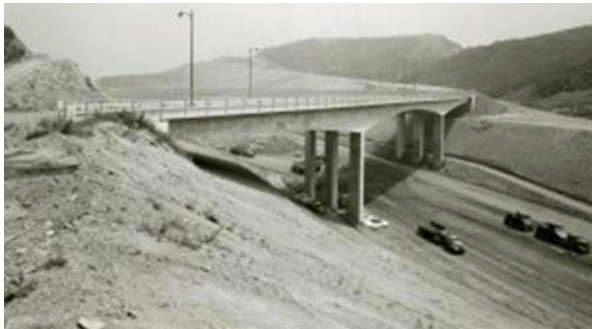
Mulholland Bridge under construction, 1960

The recently proposed realignment of the Mulholland Bridge over the I-405 will drastically alter the look and feel of iconic Mulholland Drive. Instead of the continuous scenic ridgeline alignment, the bridge would be angled to the south, with the east end intersecting with Skirball Center Drive 200-400 feet from the current bridge at a six-lane T-intersection. The widening of Skirball Center Drive would require approximately 33,000 cubic yards of grading and massive retaining walls to support the graded hillside. The effect of this project would be to divide Mulholland Drive into two non-continuous segments on either side of the 405, severing wildlife connectivity and degrading the aesthetic and recreational experience of historic Mulholland. This drastic redesign of